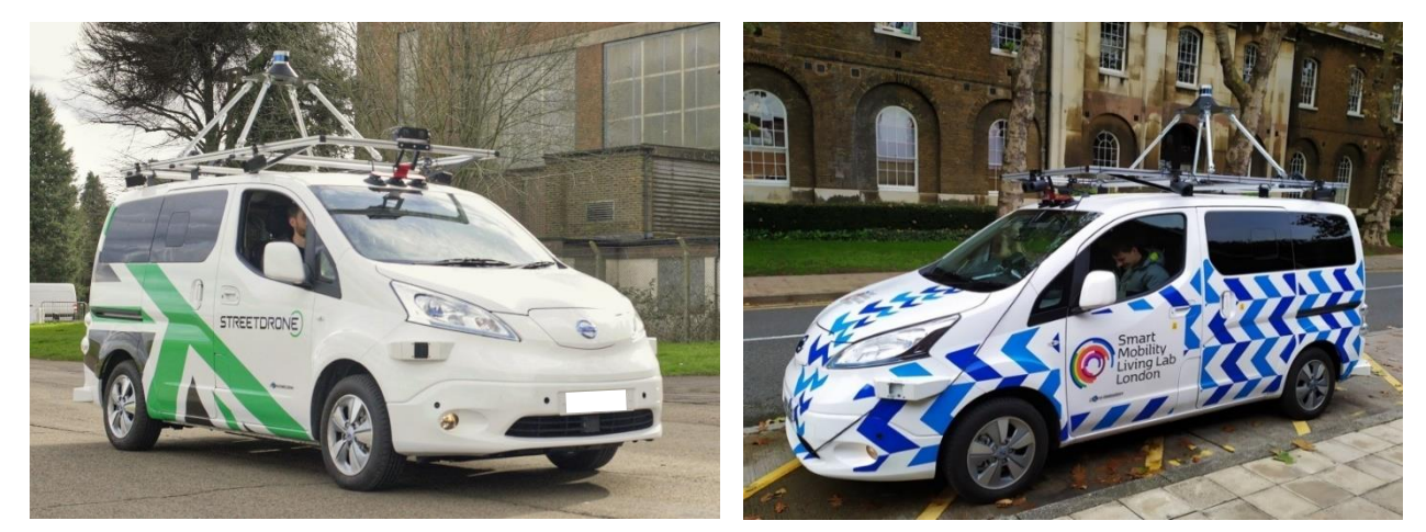
Figure 5 - Demonstration Vehicles

Both vehicles are fully compliant with MOT, insurance and Construction and Use Regulations.