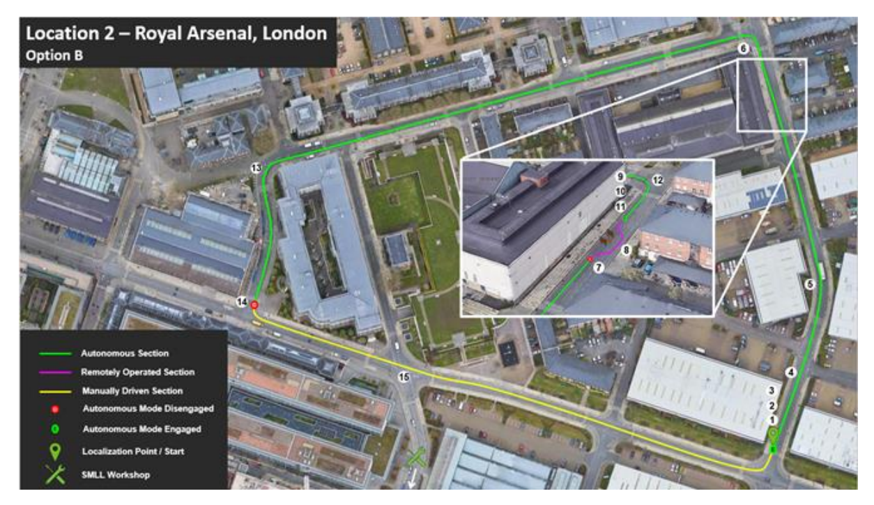
Figure 3 - SMLL Trial Route